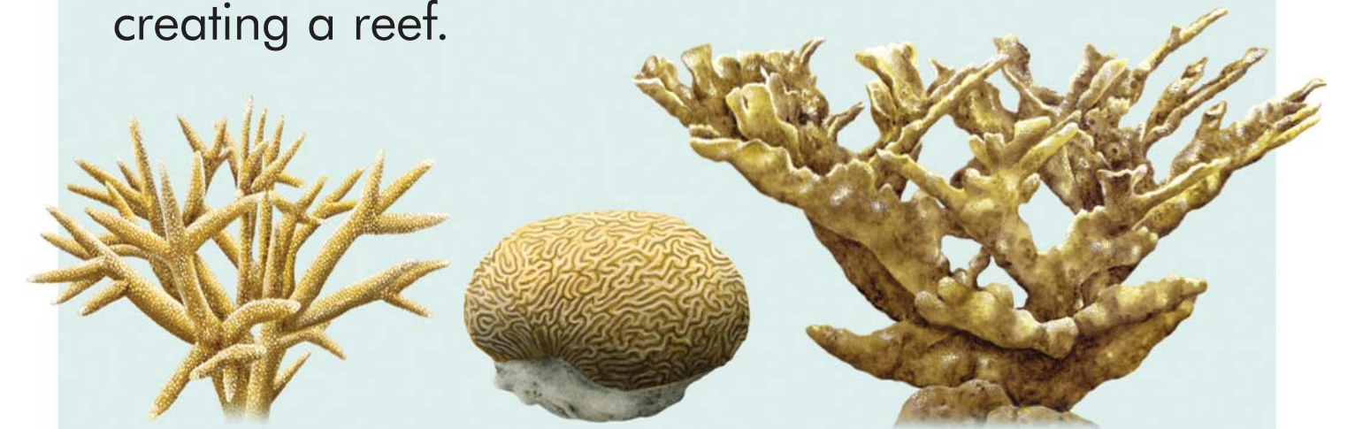
Staghorn coral Acropora cervicornis

Corals are tiny animals related to sea anemones and jellyfish. Individual animals, known as polyps, live in colonies that make up a coral head. As polyps live and die their stony skeletons slowly contribute to the growth of the coral heads, creating a reef.